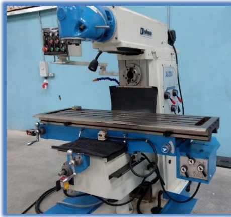
Milling Machine – Milling metal as per drawing

Milling machine cut superalloys, titanium, tensile steel to closer tolerance, a greater accuracy, and faster rate.