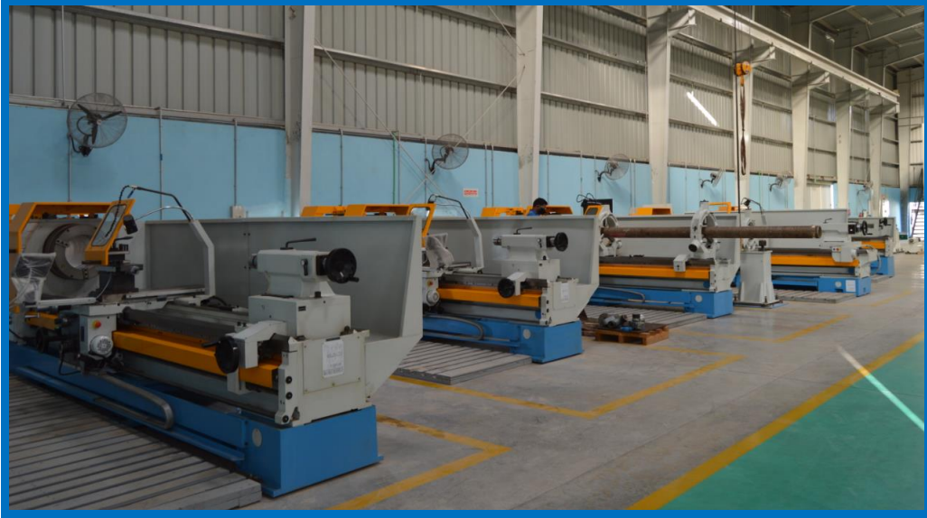
(Left to Right) 3 X Oil Country (OCTG) Lathe Machines and 3 X Universal lathe Machines