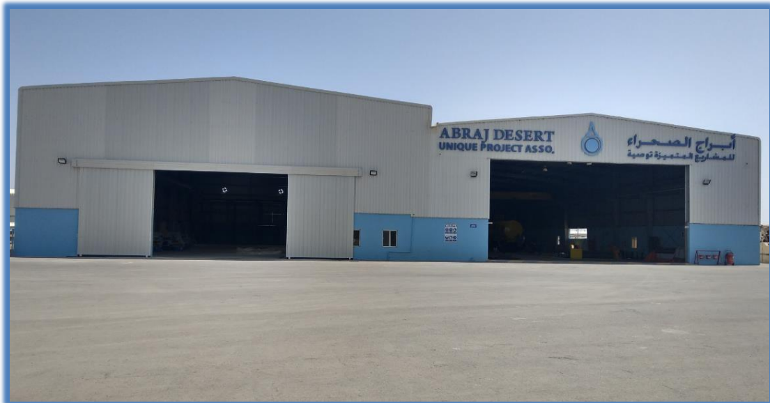
Machine shop (1250 SQM)