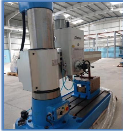
Radial Drill machine – Drilling holes different sizes into metal

The tasks that a radial drilling machine can do include boring holes, countersinking, and grinding off small particles in masonry works.