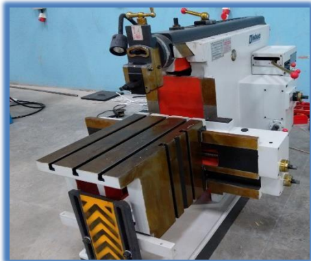
Shaping machine – shaping metal as per design