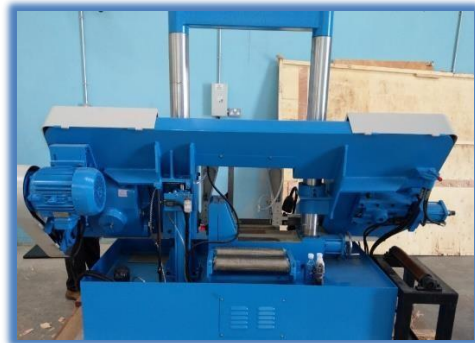
Band Saw – Material Cutting

The horizontal bandsaw device is normally used to cut large pieces of work, wood or metal, and different blades make different cuts. They have higher cutting speed and better accuracy. These are very suitable for cutting long bars into different shapes