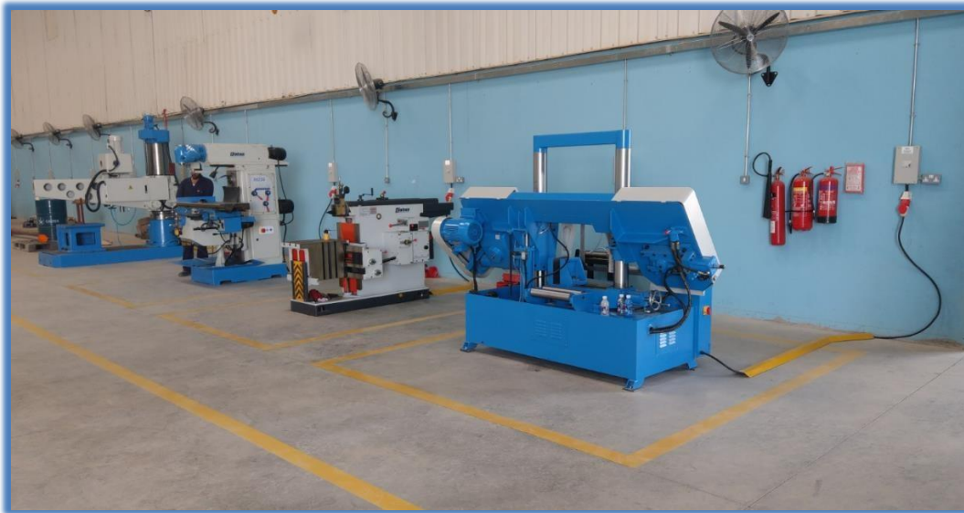
(Left to Right) Radial Drill Machine, Milling Machine, Shaping Machine and Band Saw